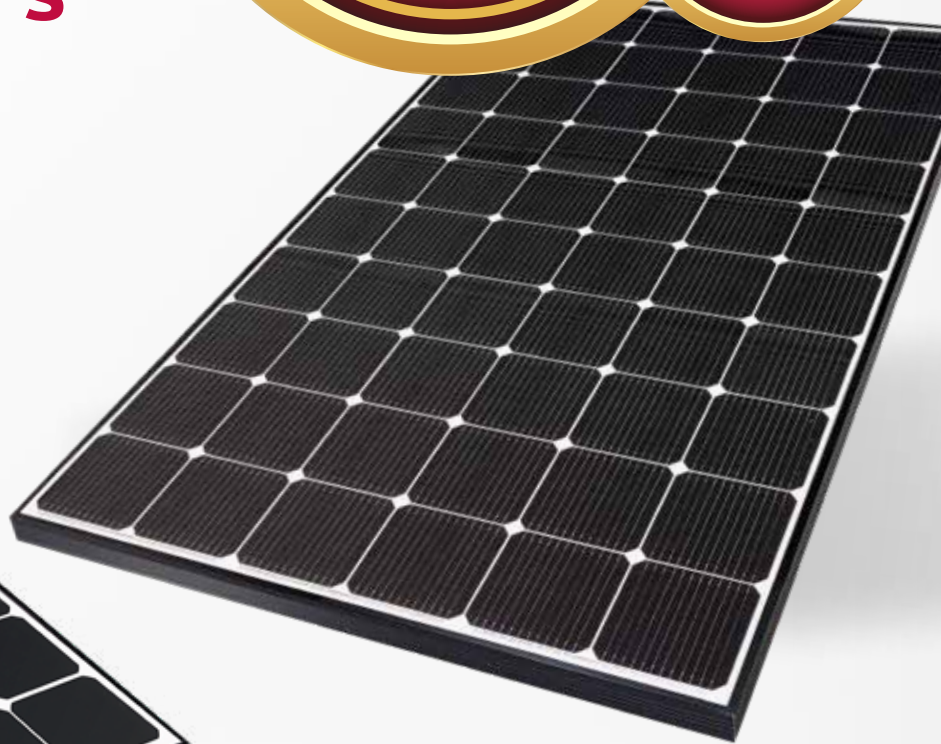
LG NeON ® 2