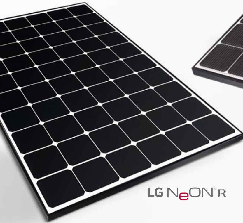
LG NeON ® R